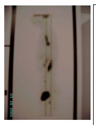
Figure 5 and 6, F18-FDG whole body PET scan report: hyperdense mass with increased FDG activitiy seen at the pineal area is suggestive of primary or secondary brain tumor. In the chest, with marked FDG uptake is compatible with primary malignant lung tumor. Multiple lymph node metastases including right paratracheal, precarinal and right supraclavicular lymph nodes. Suspicious of bony secondary to S2 vertebral body