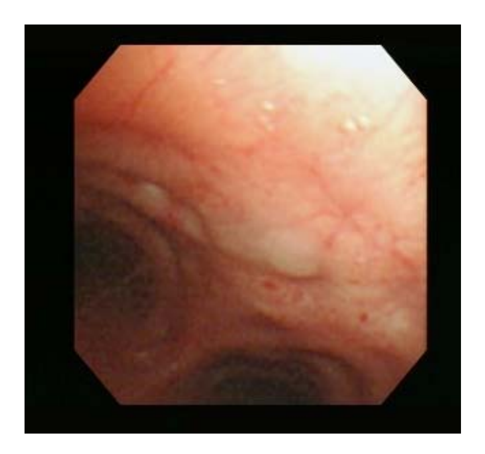
Fig. 2. Following bronchoscopic examination after radiotherapy showing a regressive change in the tumor compared with the previous examination.